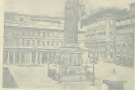
Antonine Column in the Piazza Colonna—Rome